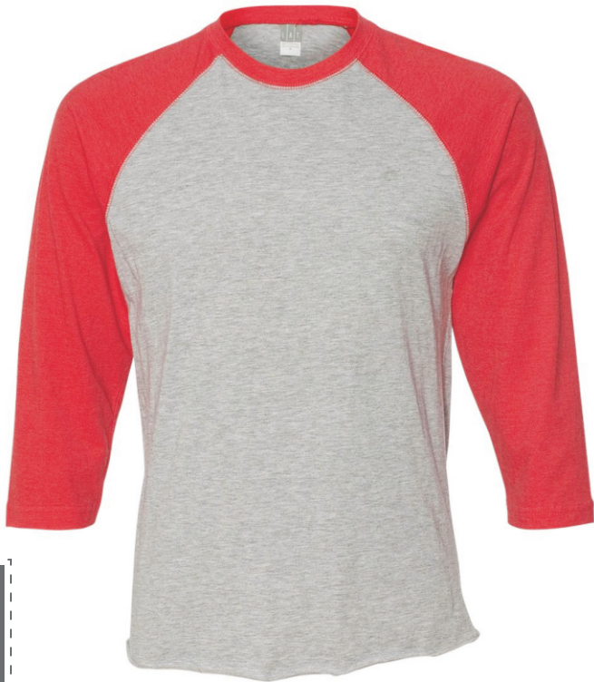
Always Free Art Work & Screen Print Set-Up