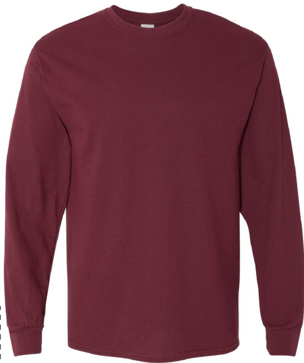
Always Free Art Work & Screen Print Set-Up